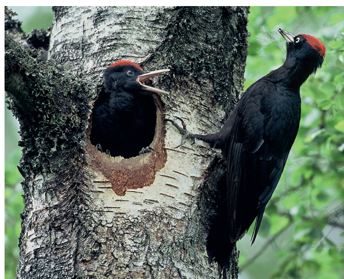
Ancient pines in the production forest are left and react positively to a bit of space.